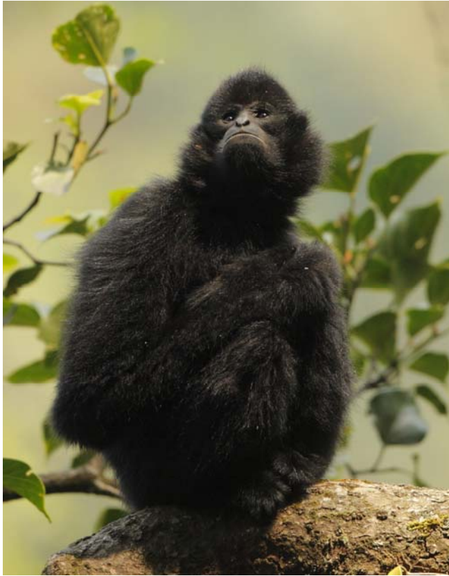
Male black crested gibbon ( Nomascus concolor )