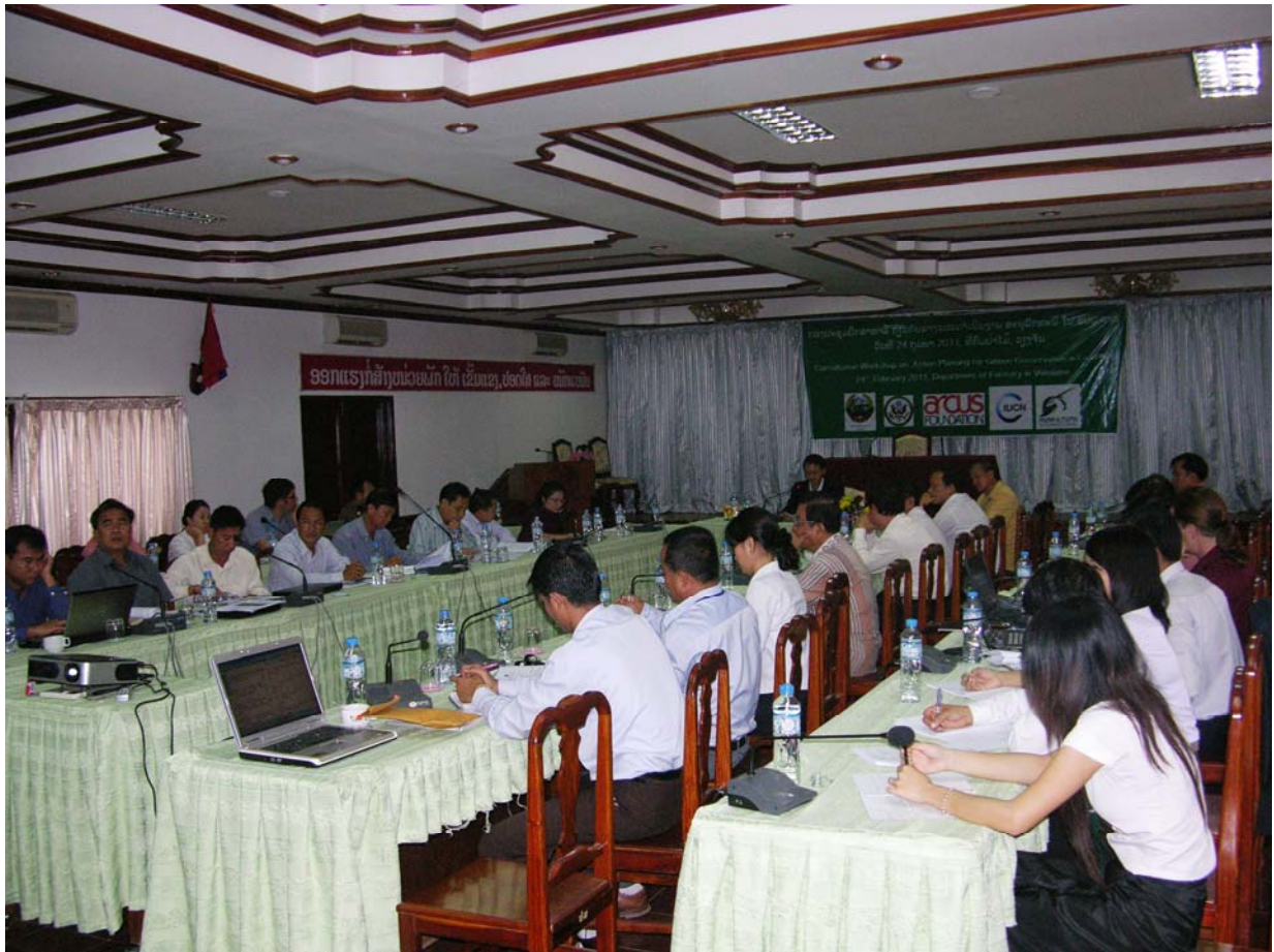
Figure 3. Photo of the Final Consultation Workshop on Gibbon Conservation Action Plan for Lao PDR. Department of Forestry, February 2011.